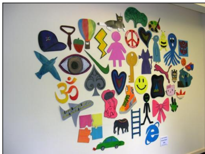
Year 8, 2009 Art Project